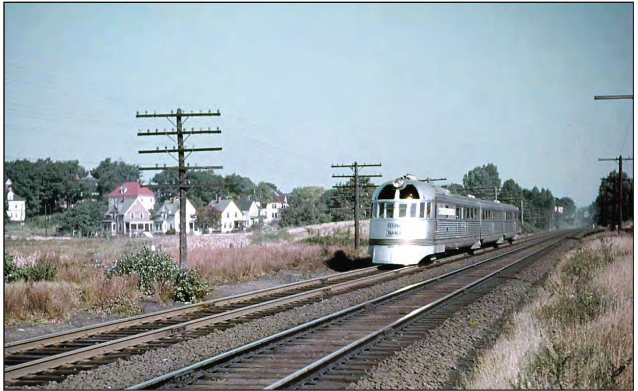
The Flying Yankee is seen on tracks in Malden, Mass, in this undated photo.

By 2003, the FYRG was out of money, and work ceased. The working relationship between the FYRG and the Claremont and Concord deteriorated, and the restoration group made the decision to relocate the train. It ultimately decided to move it to Plymouth & Lincoln Railroad (better known as the Hobo Railroad) of Lincoln, for the next phase of res-