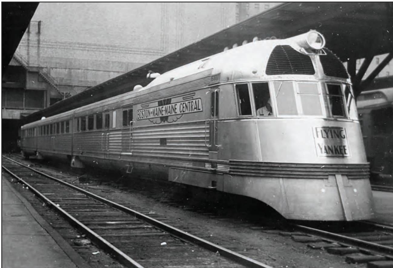
The Flying Yankee, seen in Boston in an undated photo, ran a regular route to Portland, Maine.

He would not say how many submissions they received, but one was certainly from the Nash-