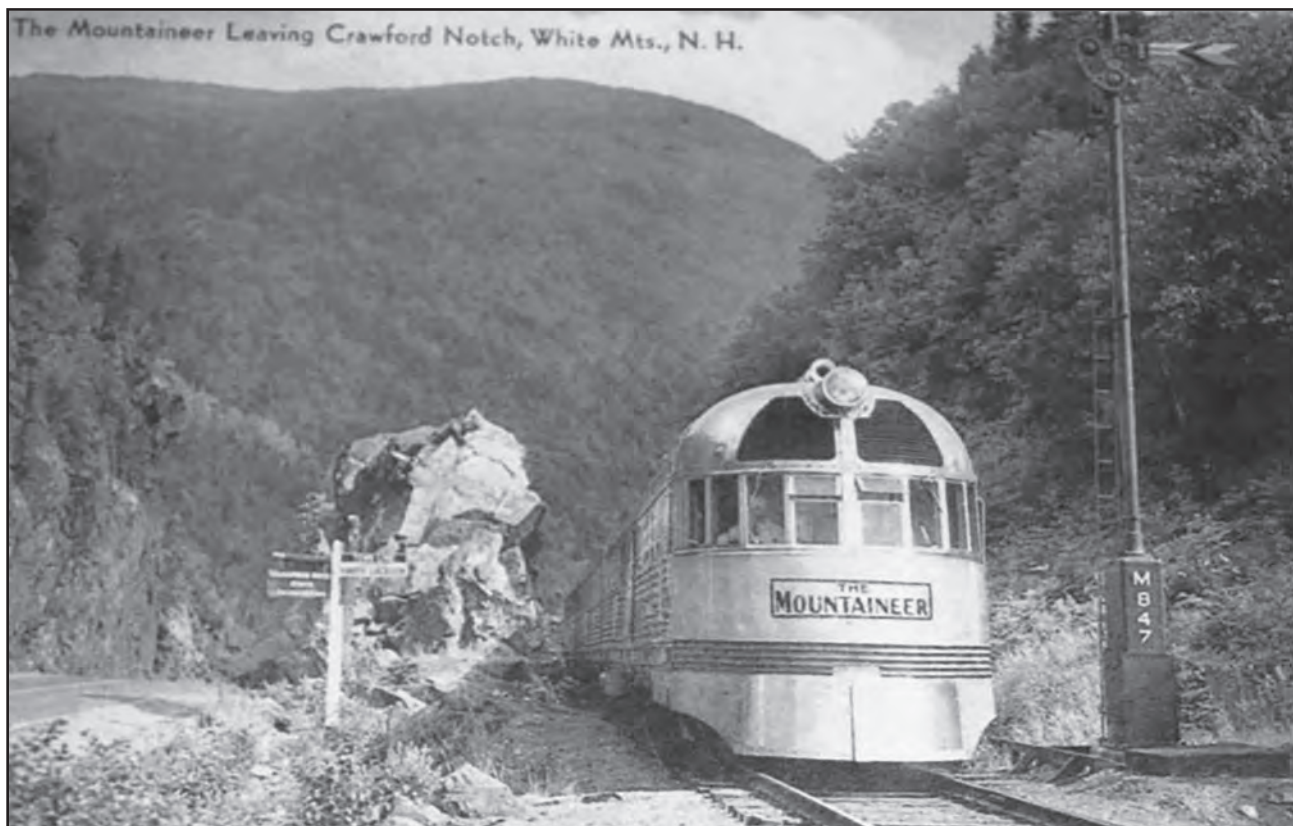
The Flying Yankee, then known as The Mountaineer, is seen on the Crawford Notch tracks in 1944.

The train was delivered in February 1935 and toured the Boston & Maine-Maine Central Railroad system before entering service on April 1 of that year. The daily route served began in Portland Maine, then to Boston, followed by a return to Port-