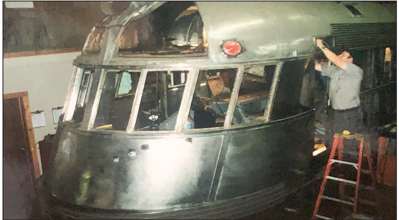
A crew member at the Concord and Claremont Railroad is shown working on the Flying Yankee in August 2002 after it was moved to Claremont in 1997 from Glen before finding a home at the Hobo Railroad in Lincoln in 2005.