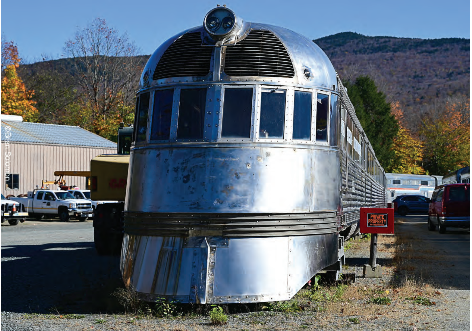
The Flying Yankee, a 1930s-era stainless-steel electric diesel train, is currently being stored on the grounds of the Hobo Railroad in Lincoln. But if negotiations between the state and the Flying Yankee Association go well, it may come to Conway for restoration and display.