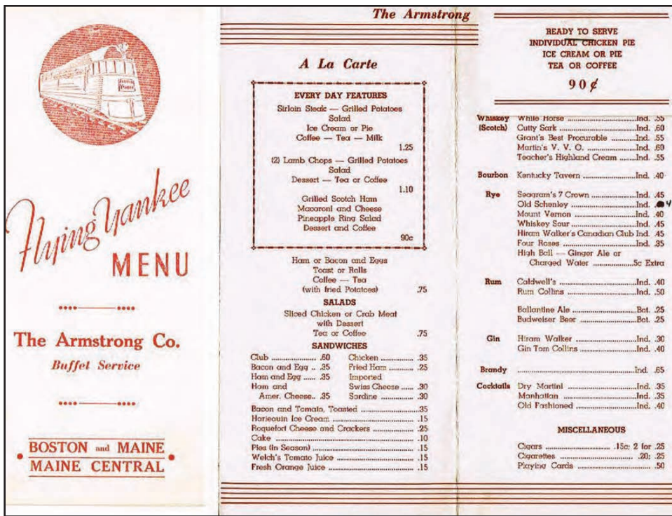
A menu from the 1940-era train. Food was catered by the Armstrong Co. as there was no dining car. Note that a club sandwich cost 60 cents, a Budweiser was a quarter.